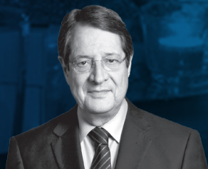
H.E. Nicos Anastasiades